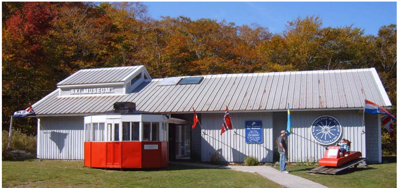
New England Ski Museum in Franconia Notch State Park in New Hampshire.