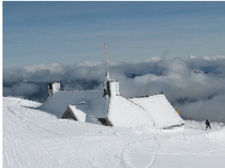
Good Morning Timberline

http://www.mthoodskipatrol.org/members/snojobs.cfm