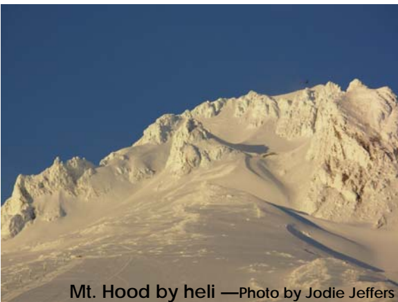
Mt. Hood by heli